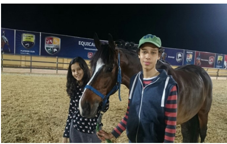
With my sister and my horse