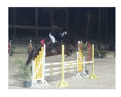
Show jumping competition