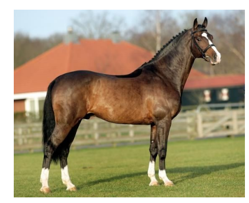
The Dutch Warmblood