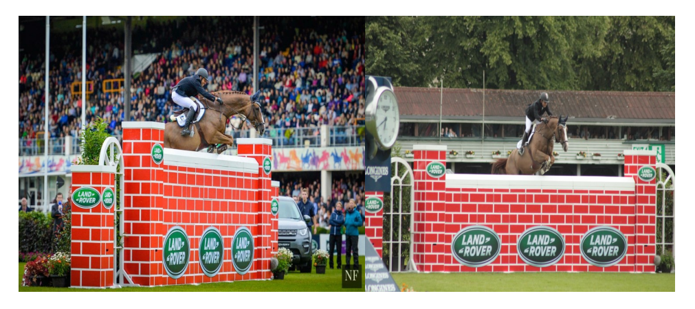
On August 9, 2015 the Egyptian rider Sameh El Dahan (world ranking 181) riding Seapatrick Cruise Cavalier won the Land Rover Puissance at the Dublin Horse Show Jumping and jumped the Puissance wall that was 2.20 meters high.