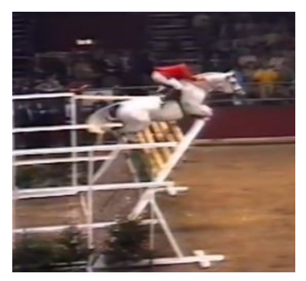
In 1978 Nick Skelton riding Lastic broke the British Show Jumping High Jump record and they jumped a fence that was 2.32 meters high.