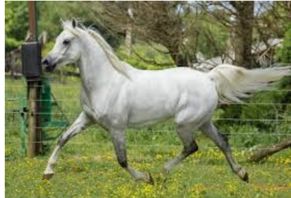
The Arabian Horse

There are some horses that are specifically bred for show jumping. That is a list of some horse breeds that compete in show jumping competitions and are bred specifically for jumping: