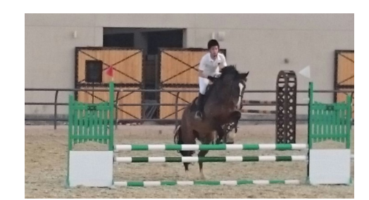
Show jumping at Platinum club