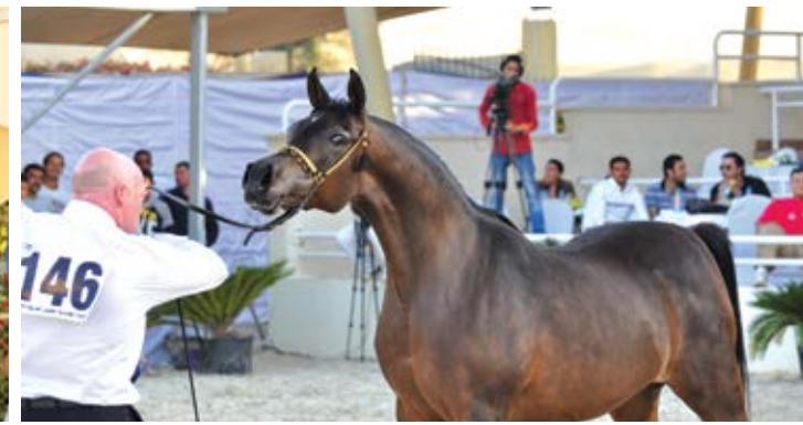
Silver mare senior females, Mohga Saqr