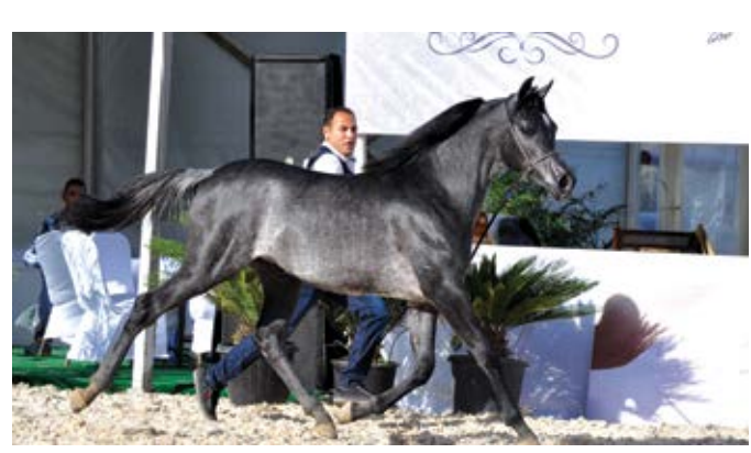
Silver filly yearling females, Karima El Rayyan Misr