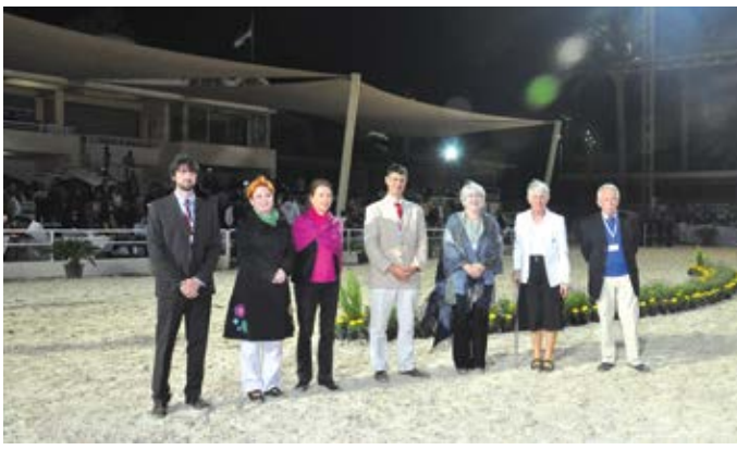
Al Khalediah Judges