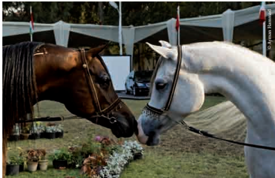
▲ Kenz Noor & Imperial Baalanah

Abaza is very keen to improve the EAO and Al Zahraa. It is a golden opportunity to make the change needed.