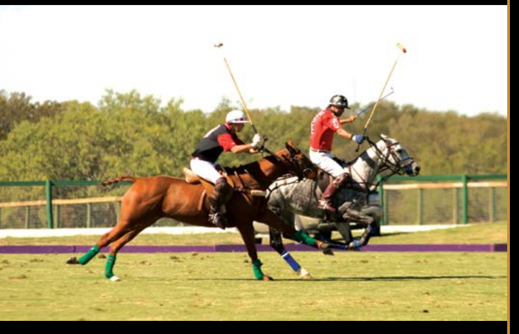
Polo, photo by CO. Normandie 2014