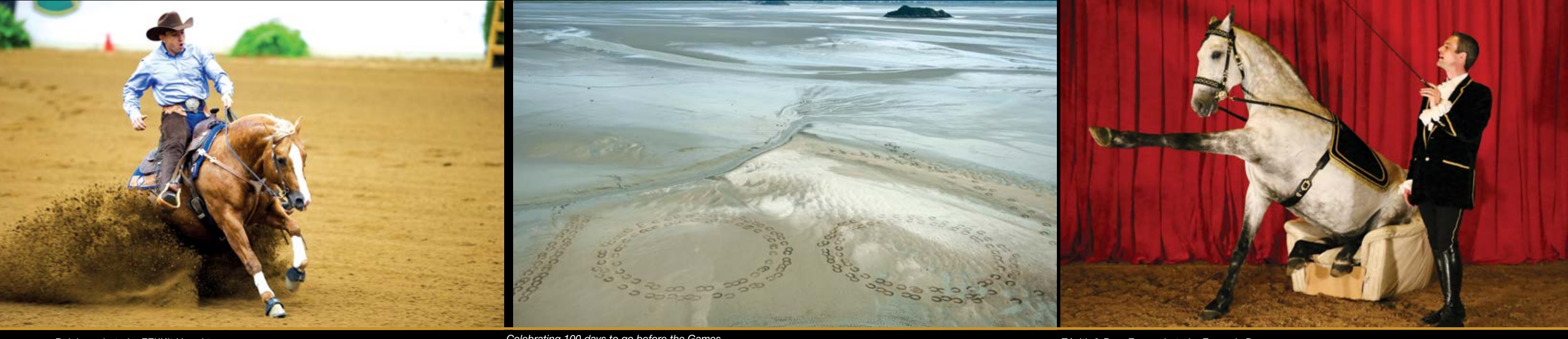
Reining, photo by FEI/Kit Houghton