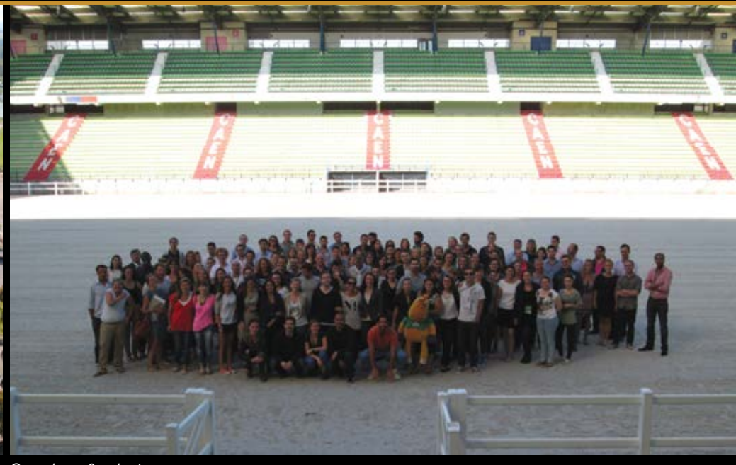
Haras du Pin