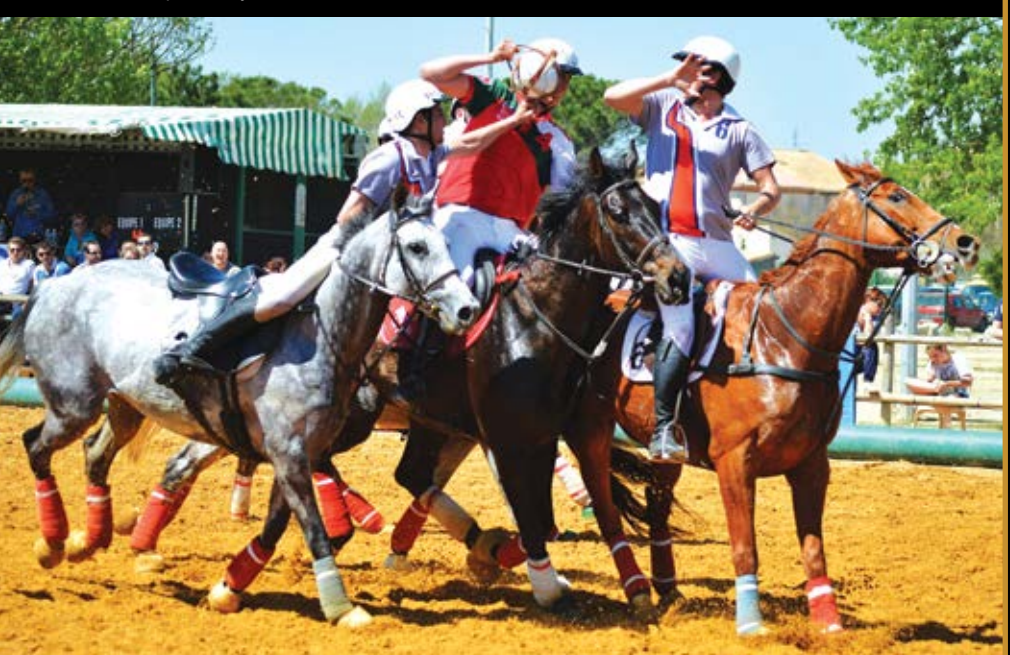
Horse ball, photo by Olivia Kohler/JuNiThi

Equestrian Federation boasts over 700,000 license holders and 7,800 clubs: it's the 3rd ranking French Olympic Federation, after those of football and tennis. The Organising Committee recruited more than 3,000 worldwide volunteers to help in make the Games a special experience. The founding members of this year's Games include: the French Government, the French Equestrian Federation, the Regional Council of Lower Normandy, the General Council of Calvados. The General Council of Manche, the General Council of Orne, the City of Caen, the Agglomeration Community of Caen la Mer, and the National Olympic and French Sports Committee. And alongside the Founders, adding to the success of the Games are the sponsors who are: Alltech as the title sponsor and Rolex, Land Rover, Sobha, France Télévisions and PMU as the official sponsors.