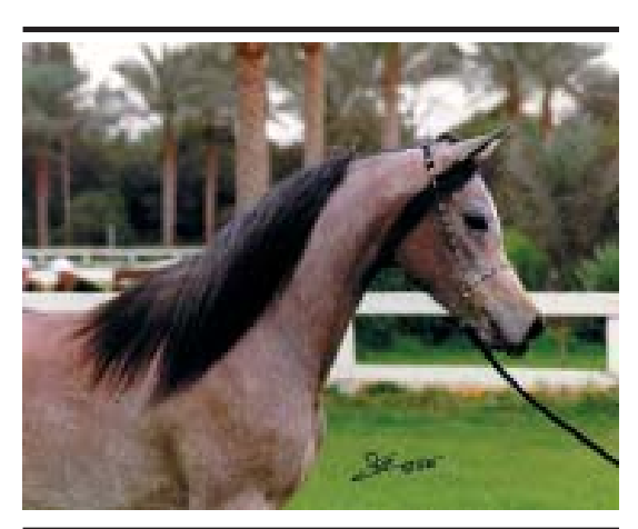
Bint El-Nil Champion Filly - Feb 99, Champion Fillies and Mares - EAO Oct 99