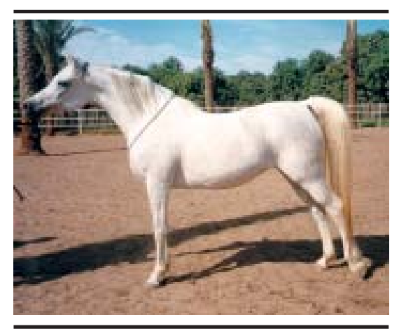
Nile Allure Champion Most Classical Head & Reserve Champion Mare - March 98

The Egyptian Arabian Horse is a priceless heritage that has been handed down to us by our ancestors, and it is our duty to keep that legacy intact. Our goal and aim is to pass on the ecstasy and pride one achieves in breeding that noble animal in its natural surroundings and conditions on to the next generation. Quality surrounds the Egyptian Arabian Horse, in fact quality has but one definition and that is the Egyptian Arabian. Grace, beauty, elegance and pride are all manifested in it and it was for these qualities and more that this noble animal was from time immemorial cherished.