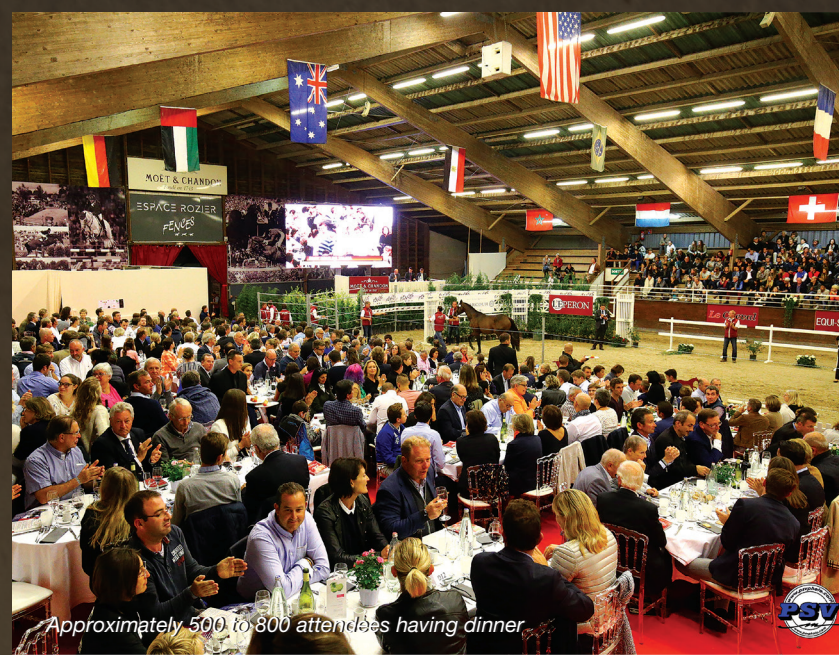
Approximately 500 to 800 attendees having dinner

A major factor that contributed to the success of the auction is the schedule of the day . Meaning that in the morning the competitions of the young horses are held and in the afternoon the auctions started. The choice of this particular schedule for the day is pretty comforting to the attendees as they get to watch the horses in the morning which consequently helps them imagine the future of what they might possibly buy in the afternoon.