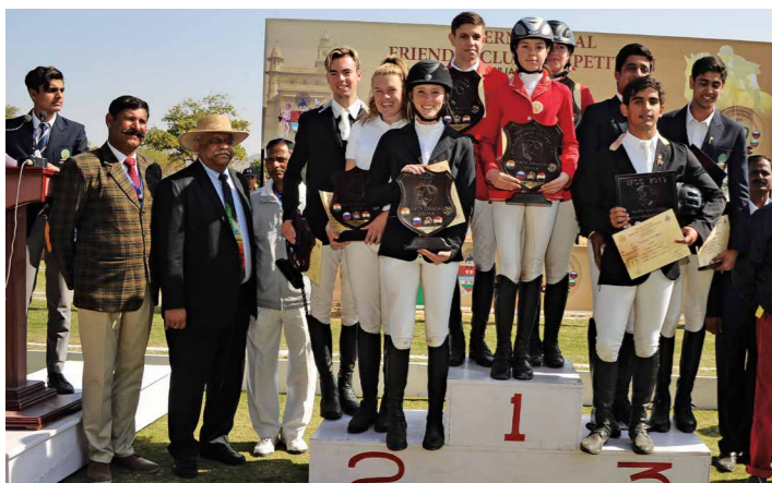
Day 2 Winners