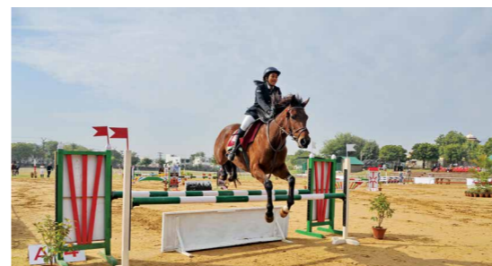
Riders at the jump