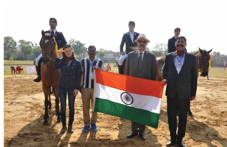
The Indian Contingent