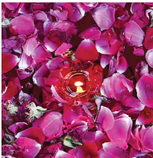
44 | Yoga sessions