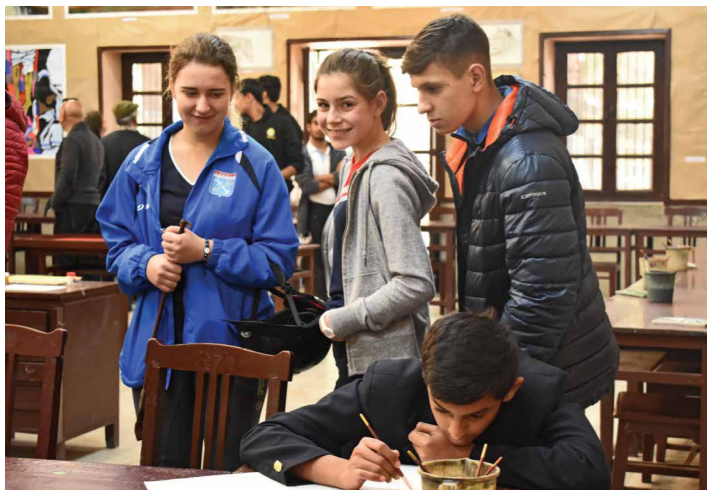
Russian Team at Art School