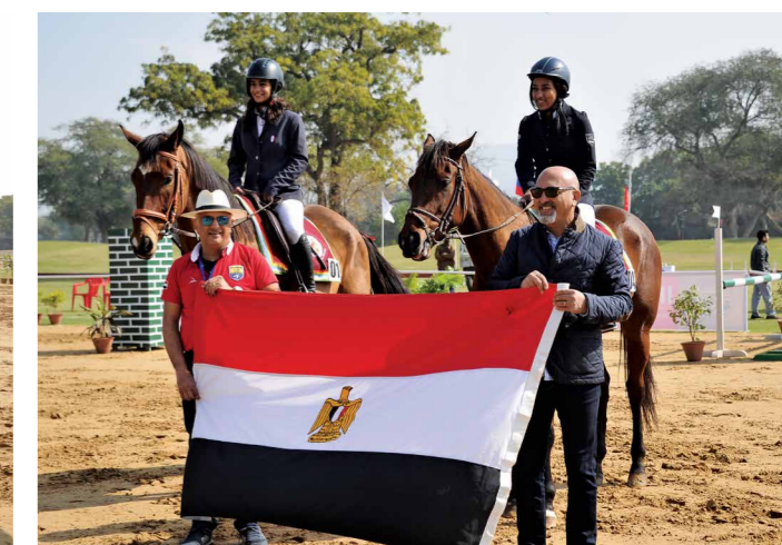
The Egyptian Contingent

Founded in 1875 by the Viceroy of India and the 6th Earl of Mayo, This college was originally built for royalty of princely states with the intention to create an "Eton of India". In October of that year Mayo's first student, H.H. Maharaja Mangal Singh of Alwar, arrived at the school gate on an elephant back accompanied by an entourage of 300 men, horses, camels and tigers.