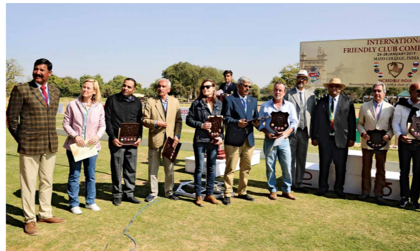
Jury With mementos