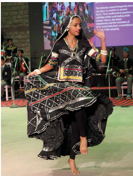
Kalbelia Dance by girls of Mayo College Girls' School