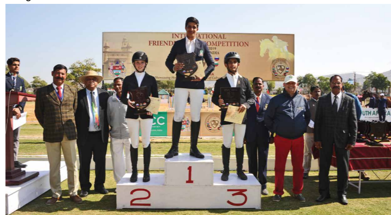
Day 1 Winners