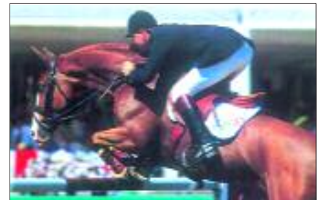
Franke Sloothaak 1994 The Hague: Franke Sloothaak on S.P. Weihawaej for Germany