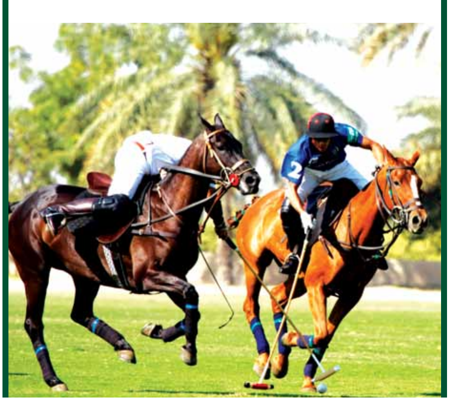
▲ Zedan v. Abu Dhabi 5 to 4 in final qualifier