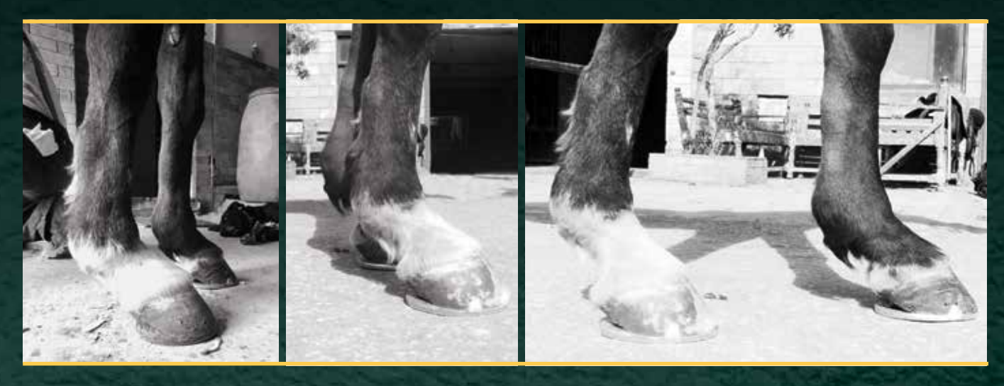
The effects of DSLD

affecting organs and tissues with a significant connective tissue component. Affected tissues documented included the deep and superficial digital flexor tendons, strategy. patellar ligaments, aorta, coronary arteries and nuchal ligaments. Conversely, another study which tried to repeat the findings did not find changes in any tissues other than the SL and flexor tendons.