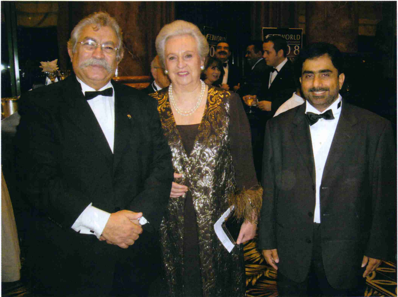
With HRH Princess Infanta Duna Pillar, FEI former President

a draw to be followed by questions from the voters to the Candidates. Again Mr. Serpieri presented himself as Freddy who has been and always will be Freddy for everybody. He explained his previously presented printed profile and emphasised on his leading role for the development programmes of the FEI during the last four years. He promised to continue on doing so and keep the same three FEI disciplines in the Olympic Games. HRH Princess Benedikte of Denmark acted, more or less, in the same way as Mr. Freddy. She added a personal touch by telling the audiences about her son & daughter and their career in the Equestrian field which she supported as a mother. As for HRH Princess Haya bnt Al Hussein of Jordan, she gave a summary of what was presented in her 'Manifesto' which was to prove her goodwill of enhancing the capabilities and performance of the FEI. She surprised the audiences with a very generous contribution of 20 million euros presented to the FEI. To me, this contribution was of no relevant importance at all to the voting results, which to my estimation, was decided long before those moments even before the presentation and the to be followed debates and questions.