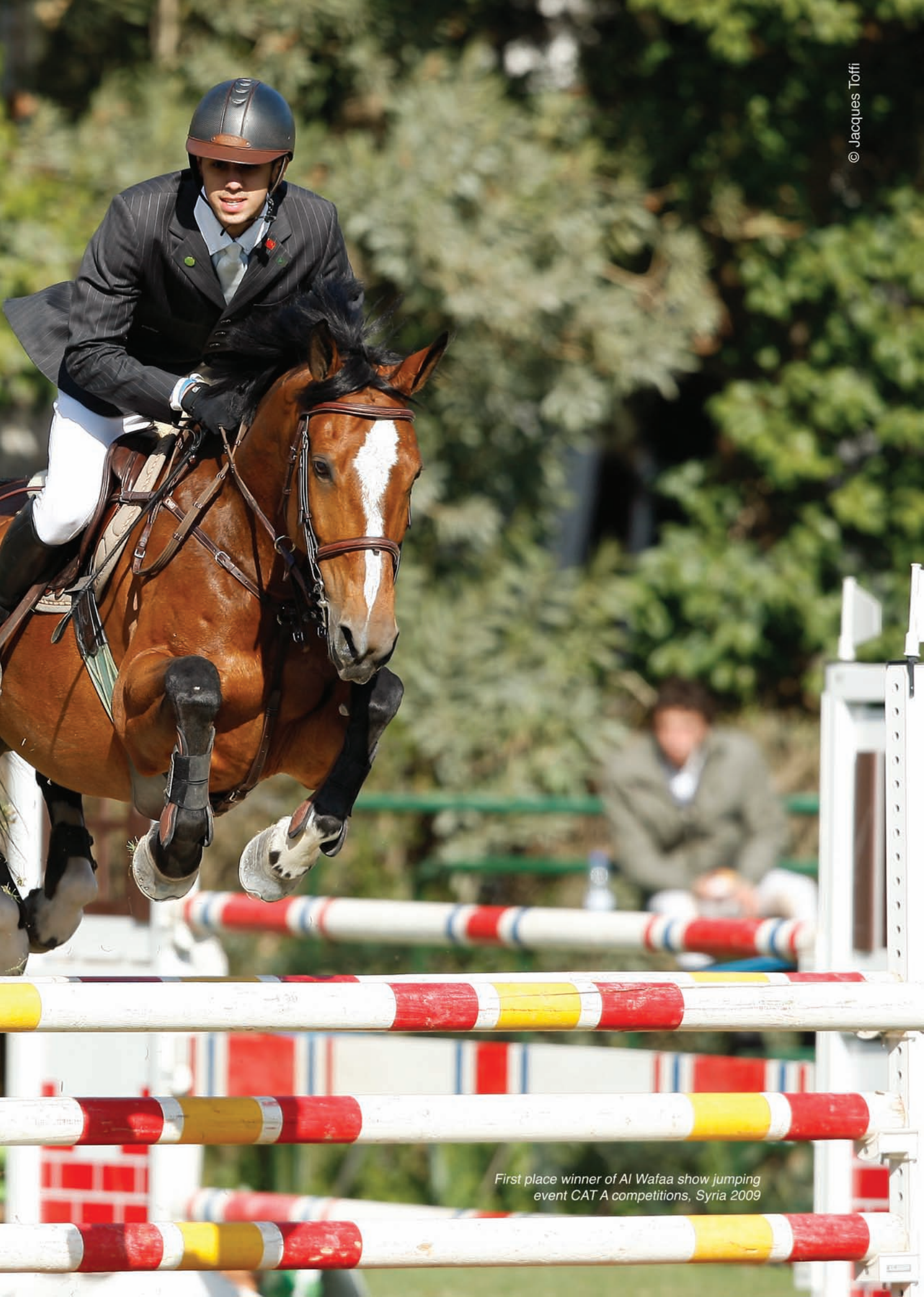
First place winner of Al Wafaa show jumping event CAT A competitions, Syria 2009