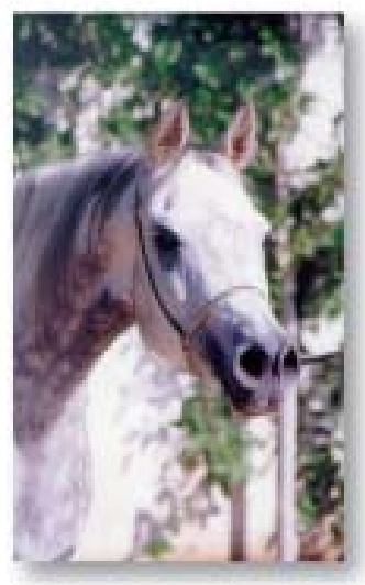
ALIDARRA ( Alidaar x G.Serima )

The colt will be traveling to Europe this summer to be shown. A further addition to the stallion row is a half brother to Imperial Madori, Al Mokhtar who is presently standing at stud in the US and will return to his homeland next spring.