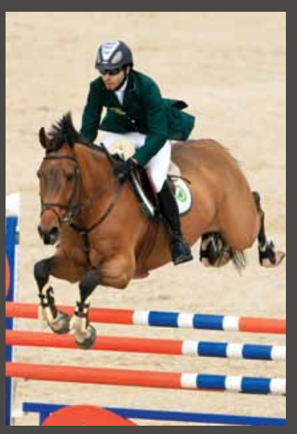
▲ HH Prince Faisal Al Shalan