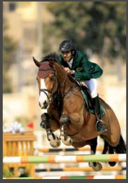
▲ HRH Prince Abdullah bin Miteb