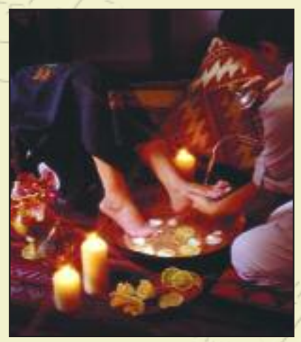
Cairo foot treatment