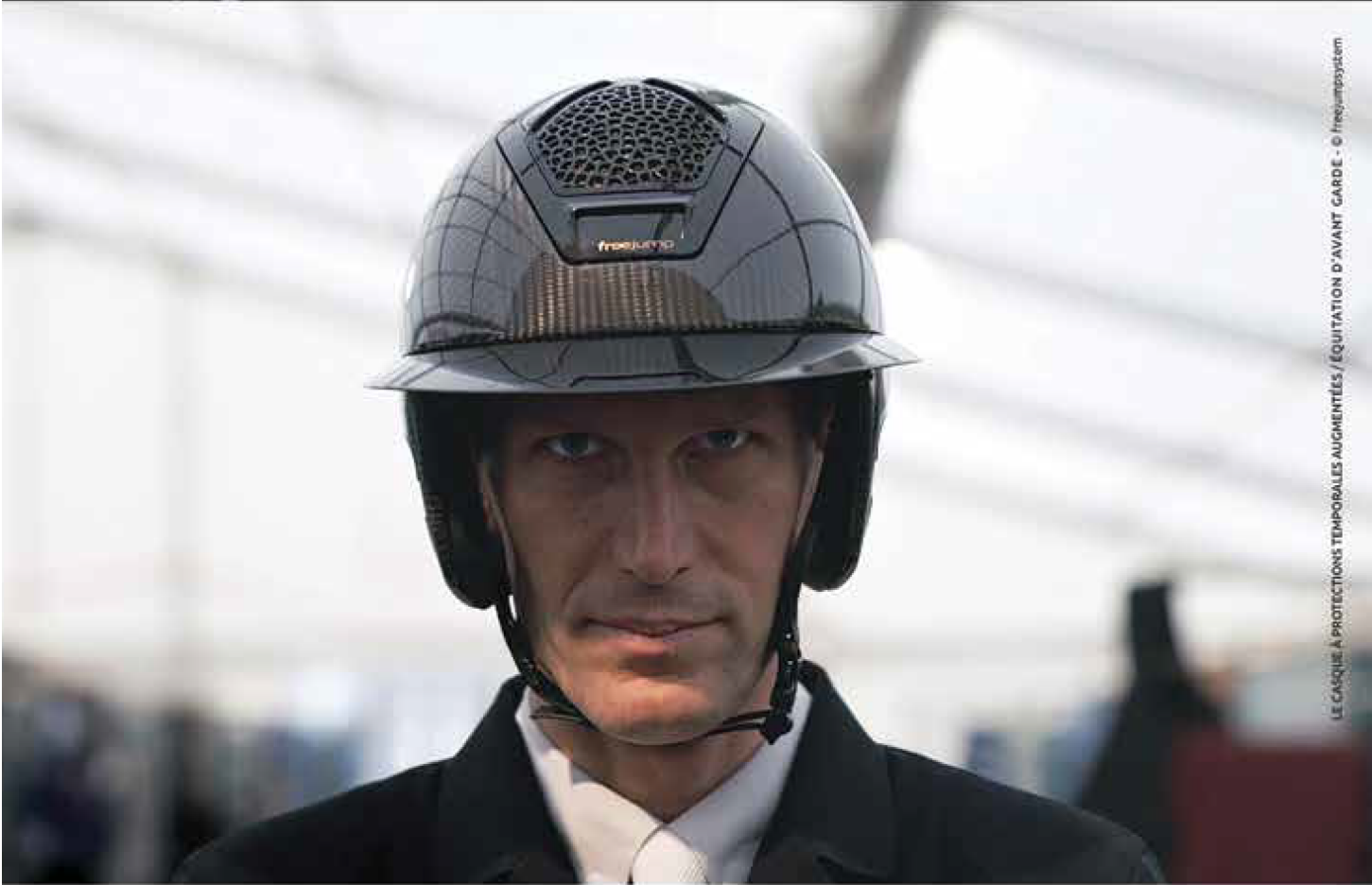
LE CASQUE À PROTECTIONS TEMPORALES AUGMENTÉES / ÉQUITATION D'AVANT GARDE