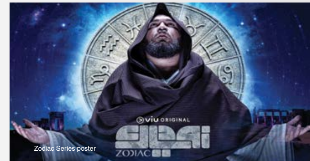
Zodiac Series poster