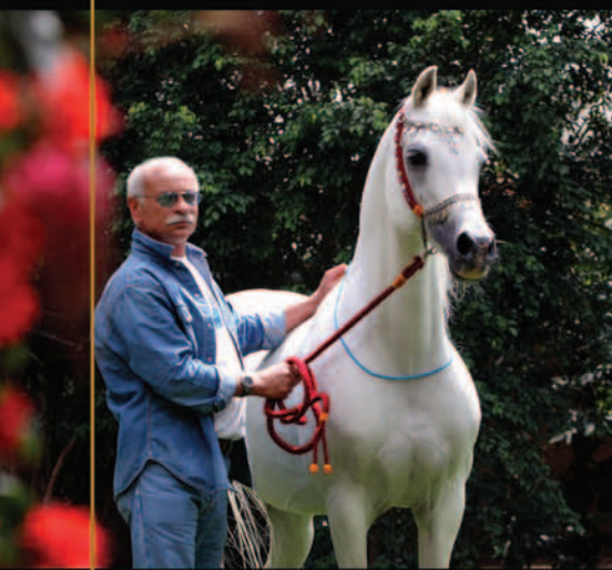
Foreword by HRH Princess Alia Bint Al Hussein