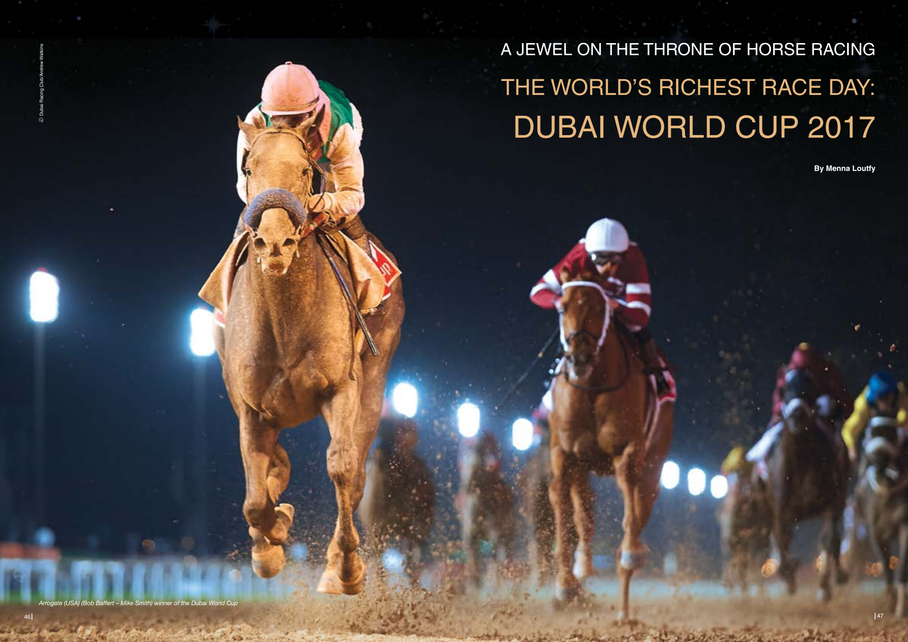
Arrogate (USA) (Bob Baffert – Mike Smith) winner of the Dubai World Cup