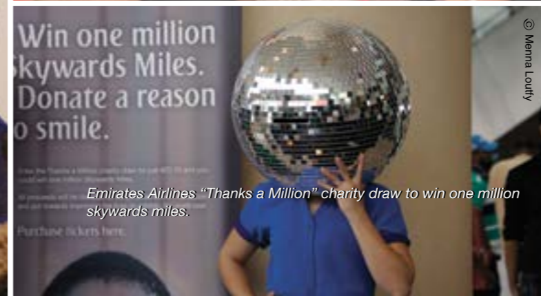
Win one million skywards Miles. Donate a reason to smile.