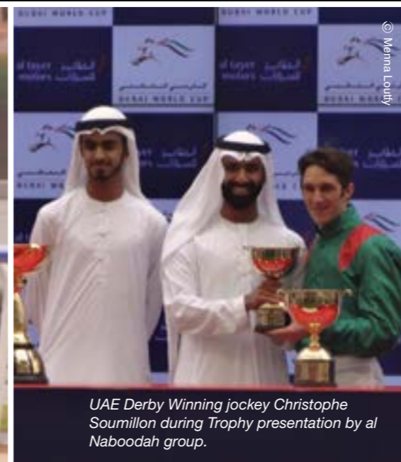
UAE Derby Winning jockey Christophe Soumillon during Trophy presentation by al Naboodah group.