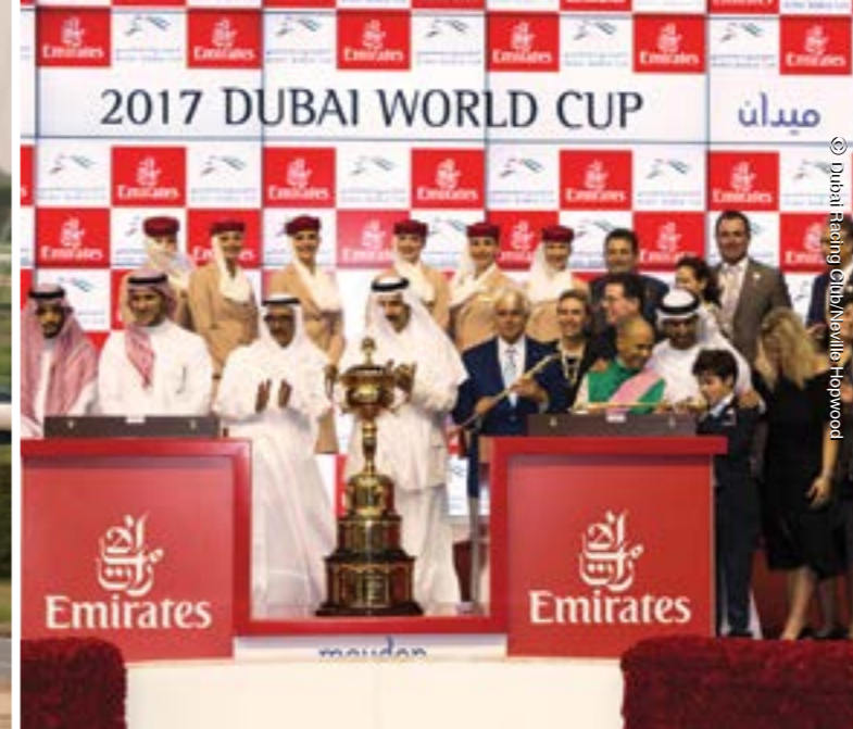
2017 DUBAI WORLD CUP