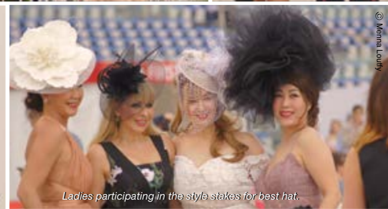
Ladies participating in the style stakes for best hat.