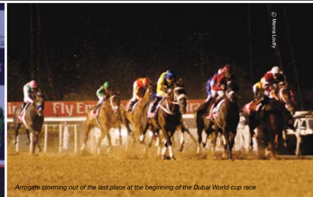
Arrogate storming out of the last place at the beginning of the Dubai World cup race