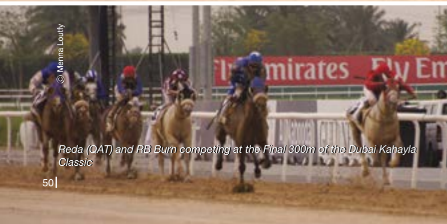
Reda (QAT) and RB Burn competing at the Final 300m of the Dubai Kahayla Classic