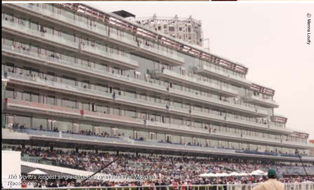
The World's longest single-structure grandstand at Meydan Racecourse