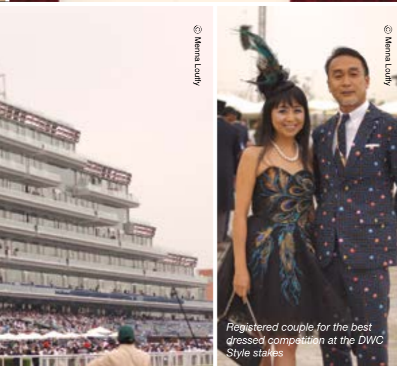
Registered couple for the best dressed competition at the DWC Style stakes