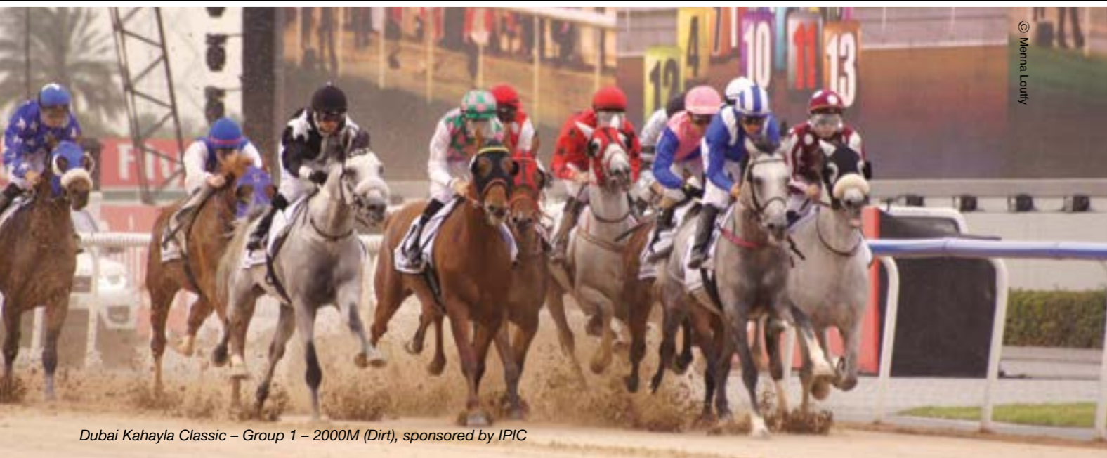
Dubai Kahayla Classic – Group 1 – 2000M (Dirt), sponsored by IPIC