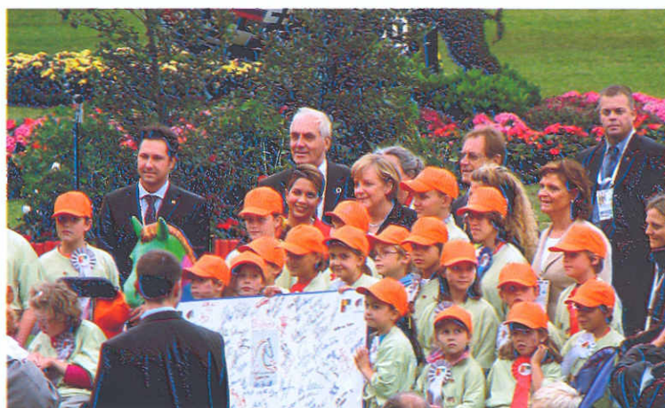
Princess Haya & German Chancellor Angela Merkel supporting therapeutic riding.