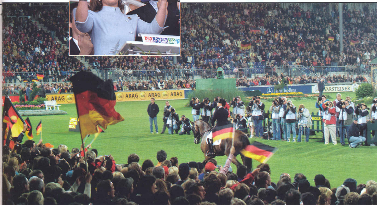
Gold and Bronze medallists German Isabell Werth & Satchmo greeting their crowd.