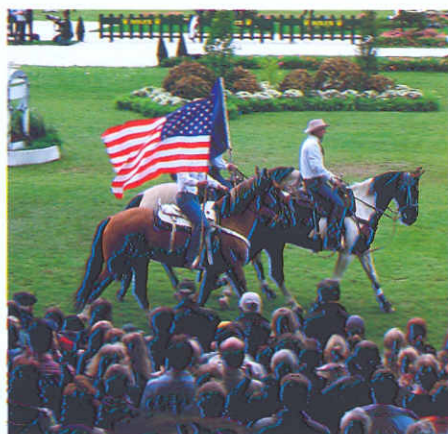
Farewell Aachen 2006, welcome Kentucky 2010.