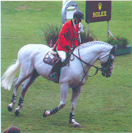
Gold for the best in jumping: Jos Lansink & Cavalor Cumano.

For the first time individual medals were granted for the dressage discipline of 'Grand Prix Special'. The best couple was German Isabell Werth and her horse 'Satchmo'. "It was my best ride ever", Isabell Werth commented as she was still overwhelmed by her horse. World famous Dutch Anky van Grunsven took second on her Hanoverian 'Salinero' followed by a strong Danish couple Andreas Helgstrand on his just nine years old Danish brad mare 'Matine'. Dressage came to a conclusion with breathtaking freestyle to music. More than 40.000 spectators in the arena watched the fifteen best riders presenting their 'Kur'. It was Dutch Anky van Grunsven and the Hanoverian 'Salinero' who received the highest scores. The presentation of the couple was smooth and energetic, whereby there was no end halt, still the charismatic duo danced its way to the gold medal. The favourite of the crowd was Danish Andreas Helgstrand aboard his young Danish brad mare 'Matine'. Helgstrand presented a difficult new kur. His young mare impressed everybody by phenomenal piaffe and passage. The couple was granted the silver medal. German Isabell Werth and 'Satchmo'