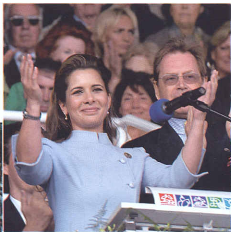
H.R.H. Princess Haya Bint Al Hussein, the new President of the International Equestrian Federation.