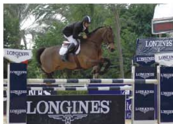
KSA team member

The Arab League is yearly improving in all aspects especially the standard of riders, horses, and show organisation, as well as the availability of more than 2 locations for the final. Organising a World Cup Final in one of the Arab countries will also be considered by the FEI.