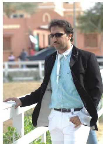
HRH Prince Badr bin Hamad