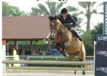
Qatari team member