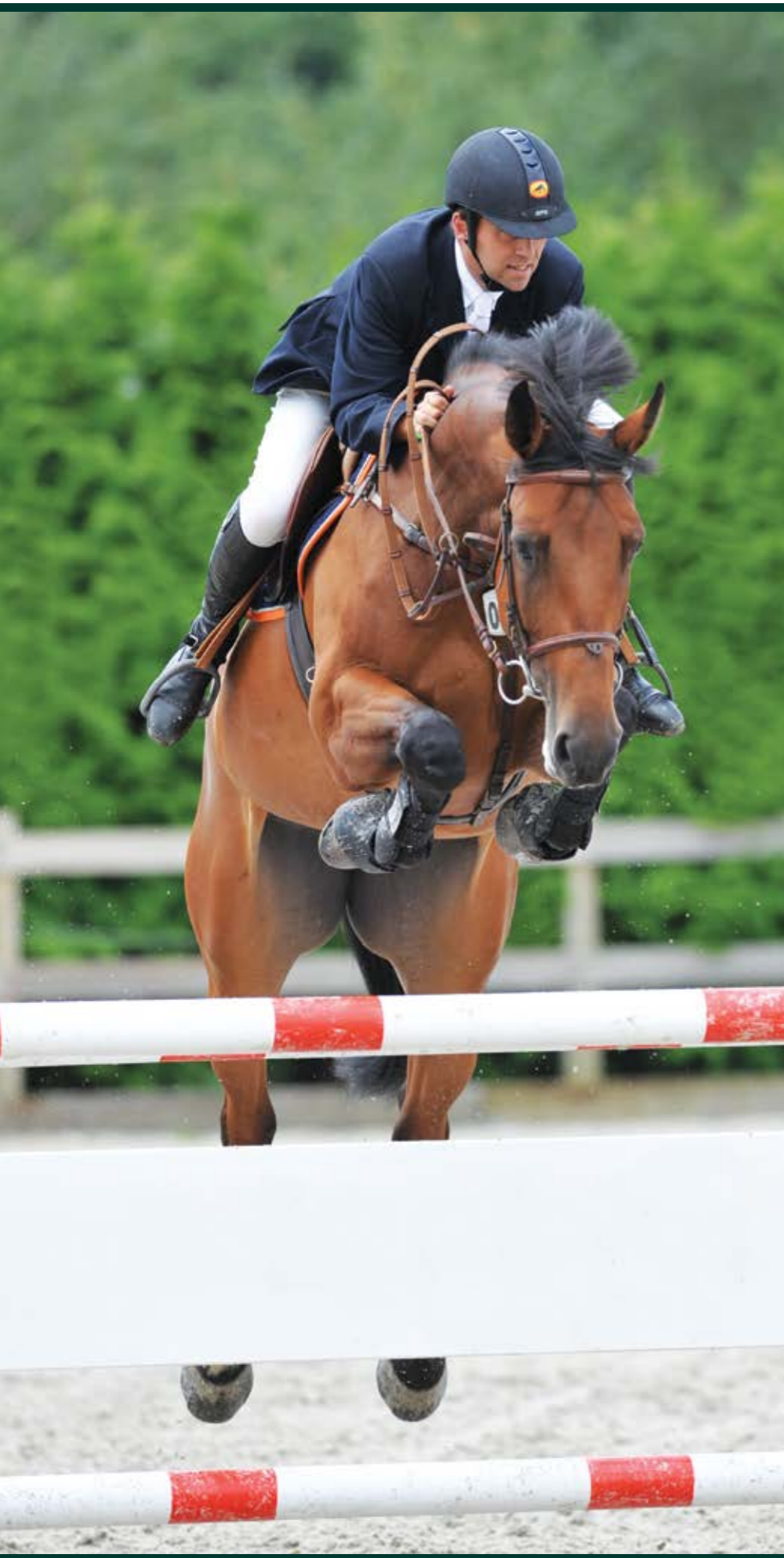
Bollen riding Cavalor Violet at CSI Herselt