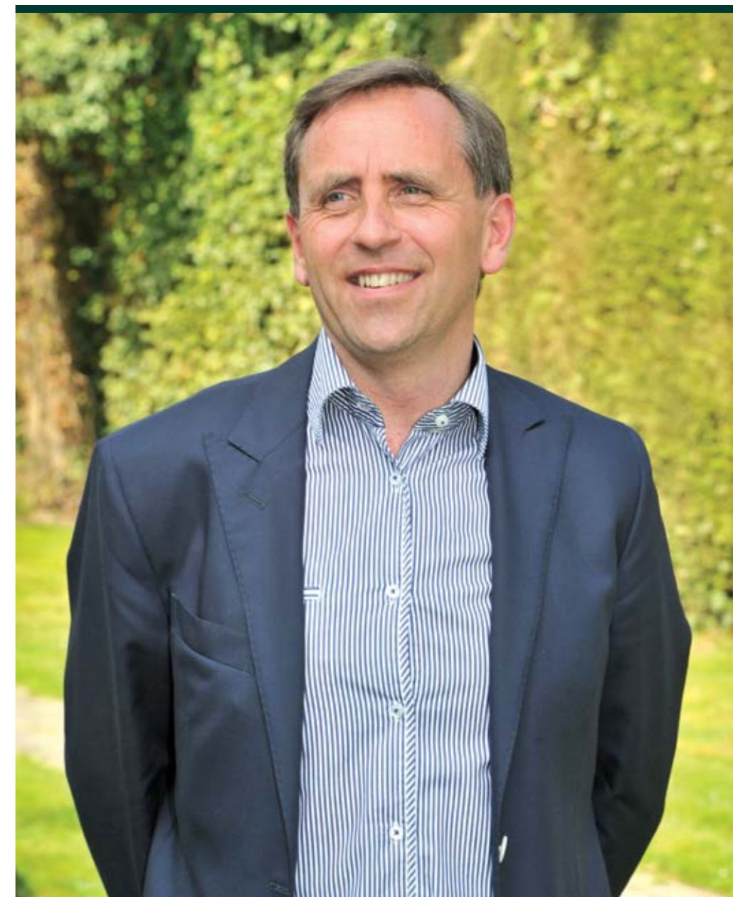
At Jumping Antwerp