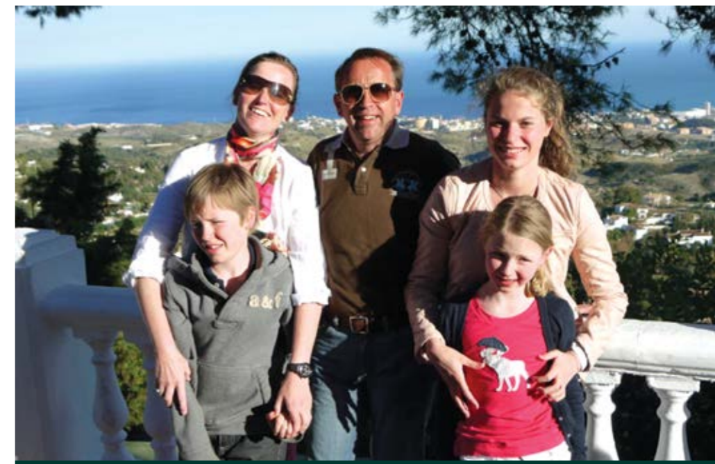
With the family