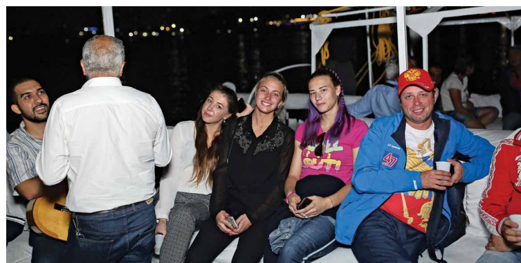
Team Derby - Nile Cruise

Next was the IFCC team competitions which was also very exciting with 8 teams competing for the title and the results were as follows,