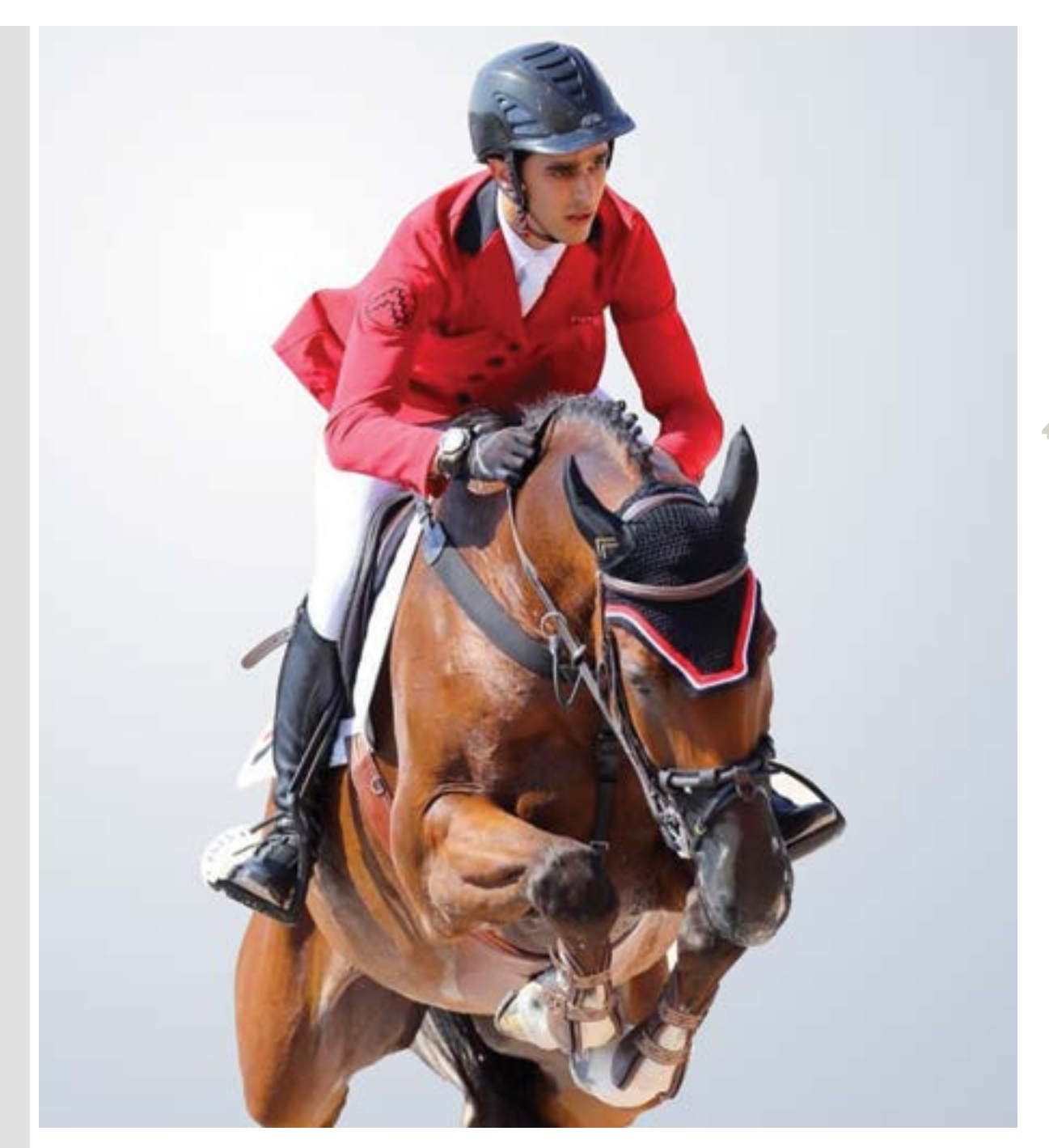
AND SUDDENLY YOU REALIZE THAT IT ALL HAPPENED! THE KID WHO WAS SO LITTLE WHEN I SAW HIM LAST WITH TALENT ALL OVER; IS REPRESENTING EGYPT IN THE OLYMPICS.