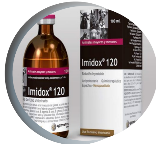
Adminstration of Oxytetracycline fig.(7)