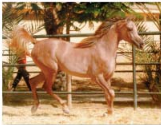
SQR GHAZAL ( Shaheen x Alidarra )

some forty internationally bred Egyptian Arabian horses were imported and returned to their homeland over the last four years. Sakr Arabian's stallions were also incorporated in their individual breeding programs.