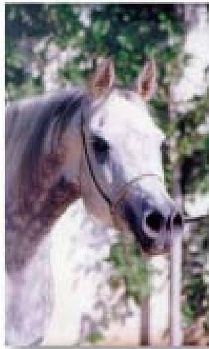
ALIDARRA ( Alidaar x G.Serima )

The colt will be traveling to Europe this summer to be shown. A further addition to the stallion row is a half brother to Imperial Madori, Al Mokhtar who is presently standing at stud in the US and will return to his homeland next spring.