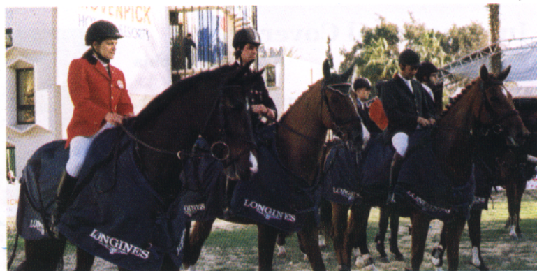
First place winning team.

Apart from the competition itself, the foreign riders were able to do some sightseeing activities. Furthermore, they also went on two trips outside Cairo; one to Sharm El Sheikh and one to the King's Ranch riding center in Alexandria. Besides a welcome and a farewell party were organized for them in the hotel, and a Gala - Dinner given by the Egyptian Equestrian Federation during a Nile boat cruise.