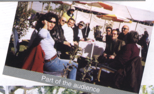
Part of the audience