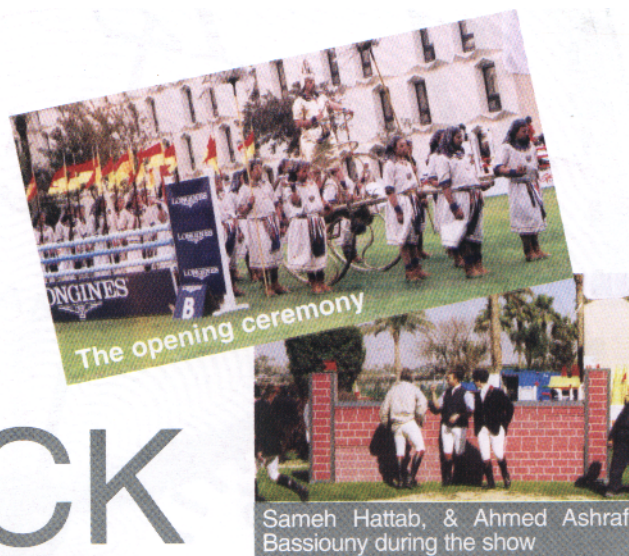
The opening ceremony

The third class held on the last day, was the Mixed Teams competition. Each team consisted of 4 riders, competing in two identical rounds plus one jump off against the clock for first place. The class was of maximum height 125 cm and a speed of 350m/min.