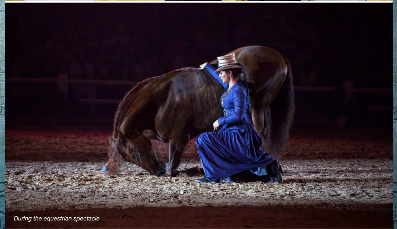
During the equestrian spectacle