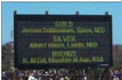
Final Individual Results