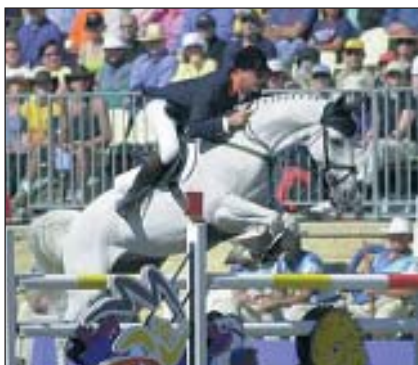
The Olympic Individual Showjumping Gold Couple; Jeroen Dubbeldam & Sjiem of the Netherlands.