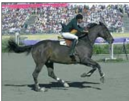
The Arab Ambassador Khaled El Eid galloping to the last fence on his way to the Bronze Olympic Individual Showjumping Medal.