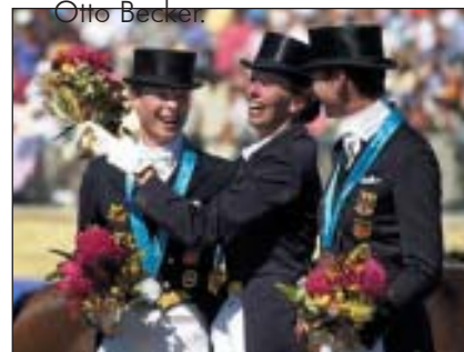
Anky van Grunsven of the Netherlands, center, smiles as she stands with Germany's Isabell Werth, left, the silver medalist and Germany's Ulla Salzgeber, the bronze medalist, right, after receiving her gold medal for the individual dressage competition.