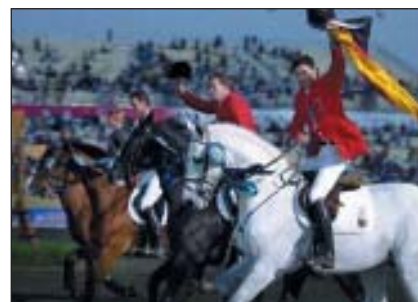
The Victorious German Team and their Olympic Gold Lap of Honor. Marcus Ehning, Ludger Beerbaum, Lars Nieberg and Otto Becker.