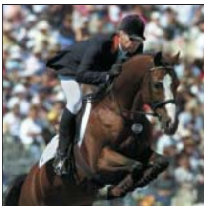
The Netherlands' Silver Olympic medalists Albert Voorn & Lando during the Individual Jumping.