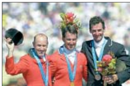
The Individual 3-Days Medalists David O'Connor, Andrew Hoy & Mark Todd.