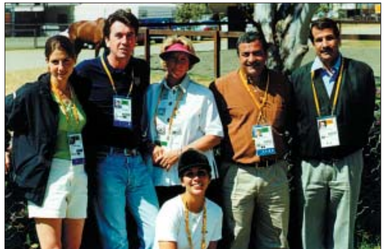
HRH Princess Haya with her team.