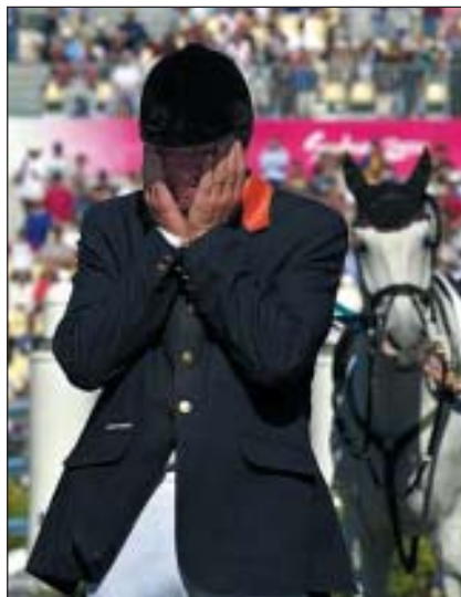
Fighting back emotion Jeroen Dubbeldam of the Netherlands, enjoys his gold medal for Olympic individual showjumping. Sunday, Oct. 1 2000.