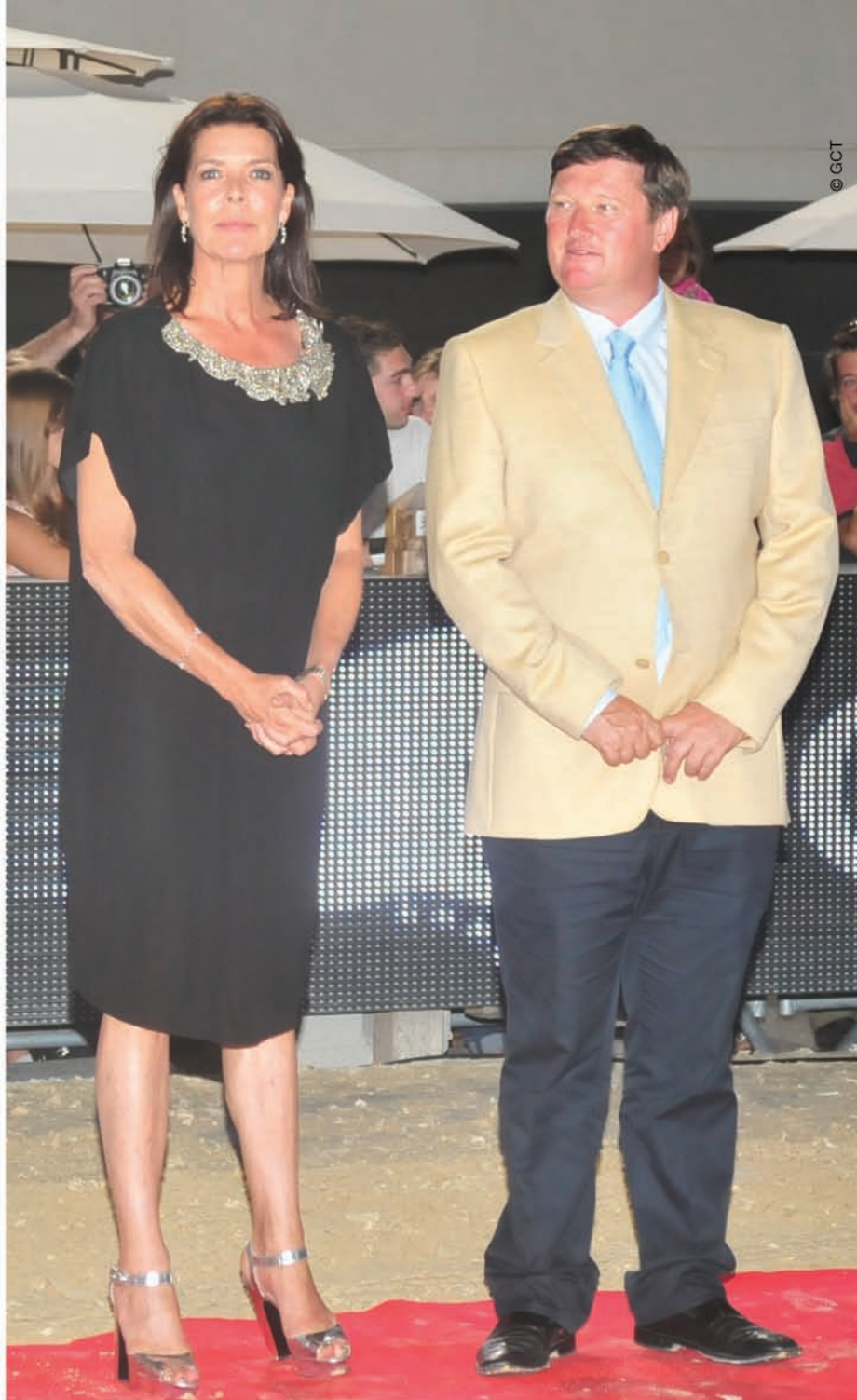
▲ HRH Princess Caroline of Monaco & Jan Tops

WITH THE FOOTBALL WORLD CUP GAMES SHOWING ON THE SCREENS IN THE RIDER'S LOUNGE, THE FIRST TWO DAYS OF THE COMPETITION MOVED ON SUBTLY WITH SWITZERLAND'S STEVE GUERDAT RIDING TRESOR AND WINNING THE 150CM ROUND OF THE FIRST DAY AND THE ALL NEW MOTHER, GERMANY'S MEREDITH MICHAELS-BEERBAUM RIDING CHECKMATE 4 AND WINNING THE 150CM ROUND OF THE SECOND DAY. THE FINAL DAY OF THE COMPETITIONS BROUGHT ABOUT THE FIVE STAR GRAND PRIX WITH 44 TOP RIDERS COMPETING IN TWO ROUNDS AND ONE JUMP OFF TO 160CM FENCES MAKING IT HARD TO PICK A WINNER.