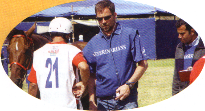
The Vet Check

very well organized, from the minute we set foot in the airport to the race itself, the equipment, and the ushering, it's all up to the highest standards. The Egyptian Equestrian Federation and the International Equestrian Federation, they are all cooperating in the success of the race". Moreover, According to Mr. Rashid, for a horse to win an endurance race he has to have a heart rate of approx. 64 beats / minute or less, a big heart, big lungs, light frames, and thin skin which dissipates heat.