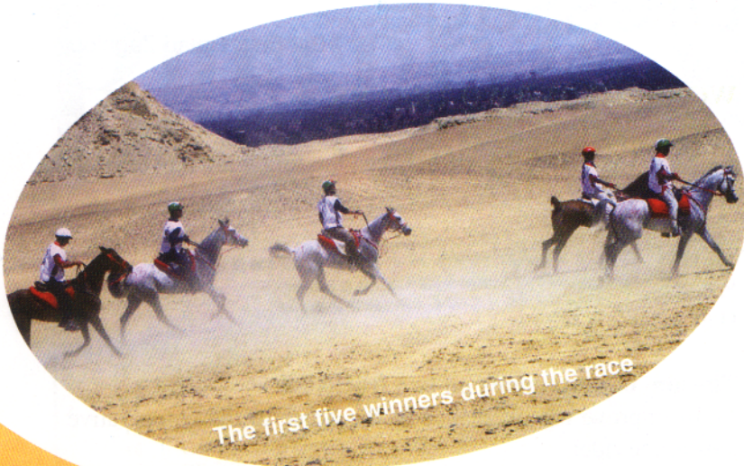
The first five winners during the race